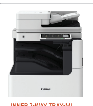
INNER 2-WAY TRAY-M1