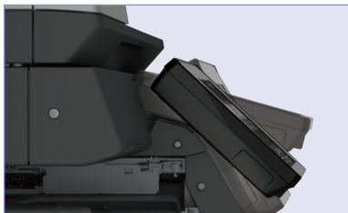
Pivoting Touchscreen offers the viewing angle for any use instantly.