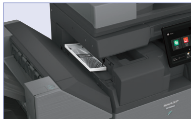
New Inner Folding Unit option offers a variety of fold patterns, including tri-fold, z-fold and others.