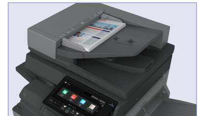
100-sheet RSPF scans documents at up to 80 images per minute.