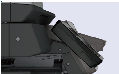
Pivoting Touchscreen offers the viewing angle for any use instantly.