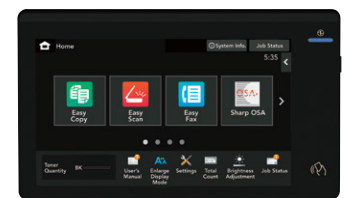
10.1" (diagonally measured) customizable touchscreen display.