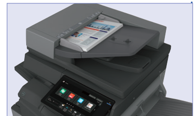
100-sheet RSPF scans documents at up to 80 images per minute.