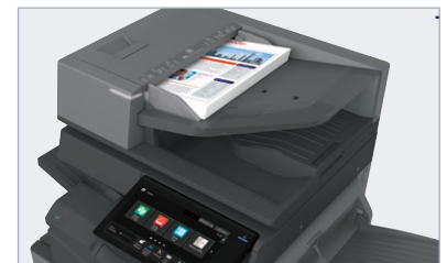
High capacity 300-sheet DSPF scans documents at up to 280 images per minute.