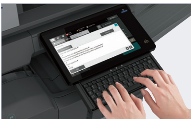
Built-in retractable keyboard simplifies email address and subject line entries.