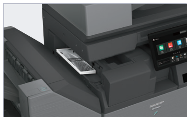
New Inner Folding Unit option offers a variety of fold patterns, including tri-fold, z-fold and others.