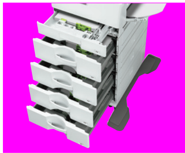
Offers up to six paper sources for a maximum 2,700-sheet capacity (shown with optional trays).