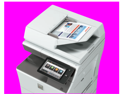
Sharp's ImageSEND™ feature provides one-touch distribution to email cloud applications and more.