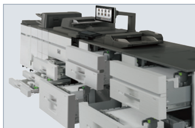
Up to 13,500-sheet paper capacity supports media up to 110 lb. cover stock (300 gsm).