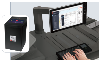
MX-PE16 Fiery Server enables full integration of Fiery Command WorkStation at the control panel.