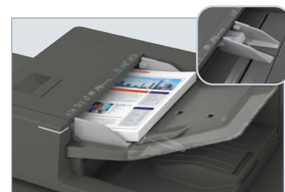
High capacity 300-sheet DSPF with 150-business card feeder for increased efficiency and scanning capabilities.