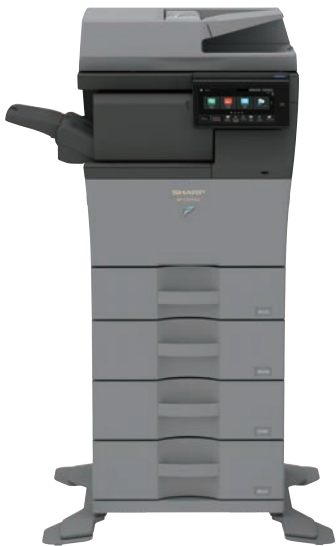
BP-C545WD shown with Inner Finishing Unit in a 4-drawer configuration.