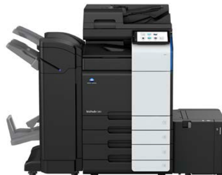
bizhub i-Series C361i