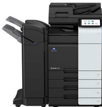
bizhub i-Series C301i