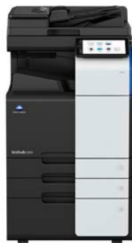
bizhub i-Series C251i